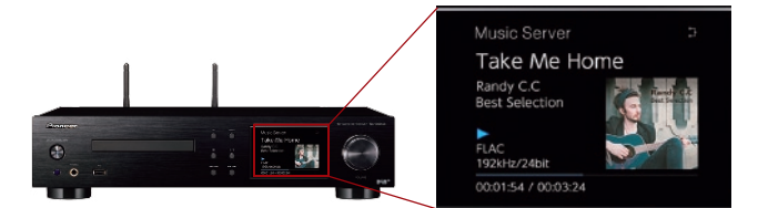
LCD Display with Song Information

* Album artwork may not be available depending on file type